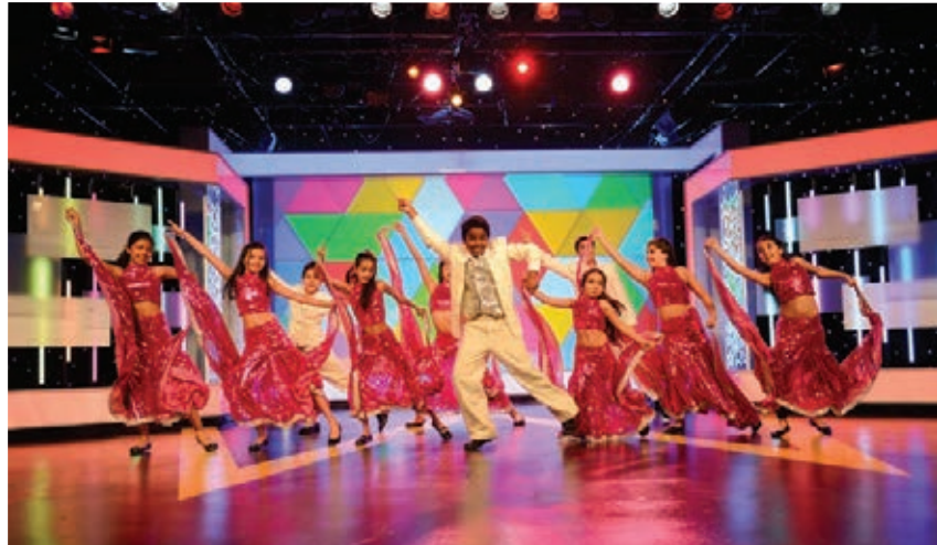
When CHCH put out a casting call for big talent in tiny packages; an overwhelming response was received from parents, individual performers and large ensembles.