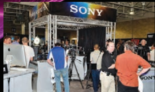
The Sony booth alone measures an incredible 2,000 sq. ft.