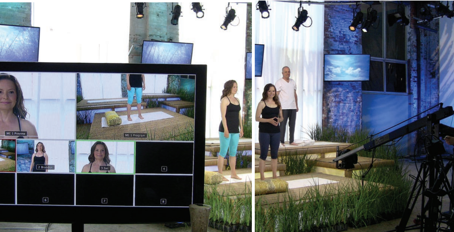
Healing Yoga: Yoga for Real People with Real Problems is produced in HD at the large Public Performance Space at the ZoomerPlex in downtown Toronto's historic Liberty Village.