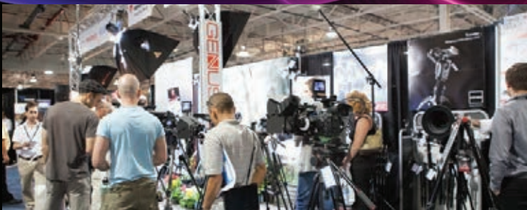
The ProFusion tradeshow floor spans a massive 70,000 sq. ft.