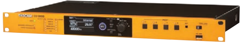
TASCAM CP-2000 Front and Rear

The CG Series has multiple functions to support maintenance, and the identification of issues if problems occur. The analyzer function measures output device termination, input level measurement (for CG-2000 and CG-1800), and the measurement of input frequencies. These built-in features enable the devices to provide troubleshooting support. Additionally, a logging function enables issues to be listed, and saved to a CSV file format on a USB flash drive.