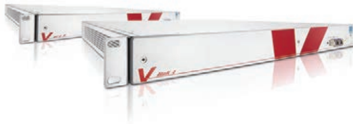
Lawo Video Stagebox

It supports raw compressed, DiracPro, J2K, Motion JPEG and H.264 codecs, used in various combinations, and has a virtual cabling system that offers MADI, RAVENNA, SDI, 1gigE and 10gigE interconnectivity.