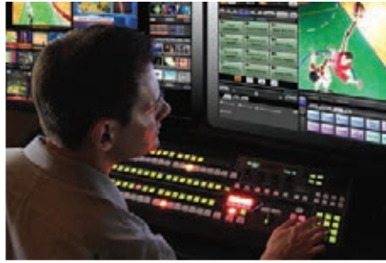
PixPlay Delivers Operator Control

PixPlay also includes an unlimited number of "in" points as part of a playback EDL, which instantly cues the proper scenes. All scoring plays during a football game, for example, can be selected and cued for instant playback at one of PixPlay's preset replay speeds.