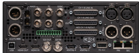
Sound Devices PIX 270i – Back Panel