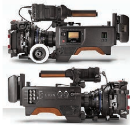
AJA CION Camera

Additionally, a back focus adjustment means the sharpest image possible can be produced. Also included are several 3G-SDI and HDMI outputs, which are all simultaneously active and supply signal to a variety of 4K/Ultra HD and 2K/HD monitors.