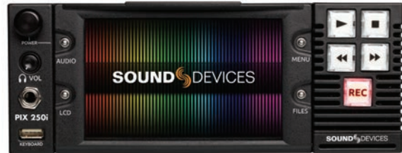
Sound Devices PIX 250i – Front Panel