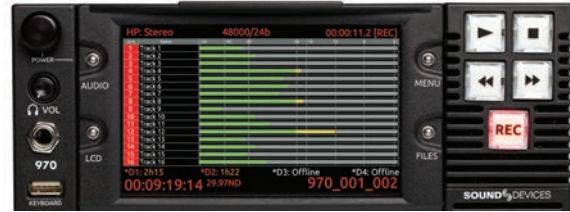
Sound Devices 970 – Front Panel

In addition, 32-track recording at 96 kHz is supported.