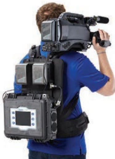
Dejero LIVE+ Carrier

In addition to managing contribution and distribution of audio and video signals over IP-based networks, the V_link4 also manages transmission of associated metadata and control information, addressed with the HTML-5 based GUI that runs on most standard Web browsers.