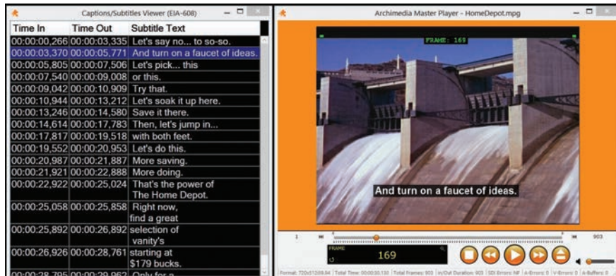
Archimedia Enterprise Player

Working in tandem with the Archimedia Master Player, the Archimedia QuSee Suite brings validation and verification functions to the desktop, allowing users to perform quality tests on files rather than on SDI streams created from files. Its tools include video and audio waveform monitors, vector-