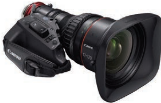
Canon Cine-Servo Zoom Lens

The microprocessor also enables a very high-speed zoom of 0.5 seconds to a very slow and consistent zoom of 300 seconds, from wide-end to tele-photo-end. Three 20-pin connectors on