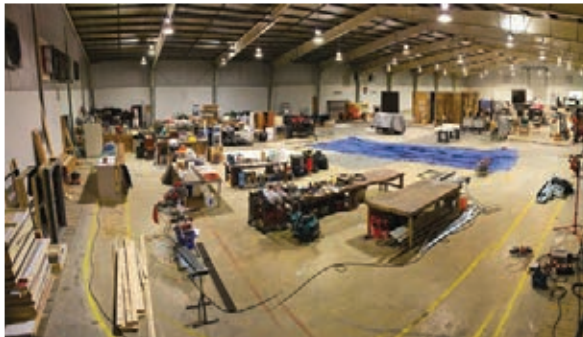
Northern Ontario Film Studios