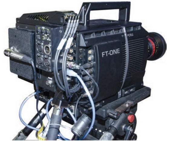
Telecast CopperHead 3404K installed on FT-ONE 4K camera from For-A

Each of the NVISION 8500 Hybrid series router frames can provide full or partial Ethernet input/output support as required by the user. Once Ethernet tie lines are established, each SDI output is mapped to an IP stream, with multiple IP streams per Ethernet port. This provides the benefits of channelling numerous packetized streams through each port with inher-