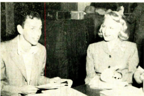
Frank Sinatra chews over the script during rehearsal with the blonde chirper.