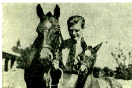
Down on the farm, 1937.