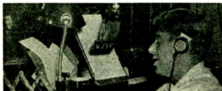
On the Washington airmen, 1934.