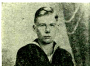
18 years old