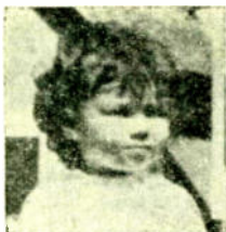
My second birthday