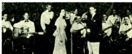
My own dance band, Washington 1934.