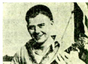
Aboard U.S.S. Ammen.