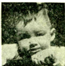
One year old