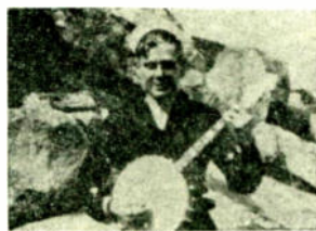
With the Coast Guard.