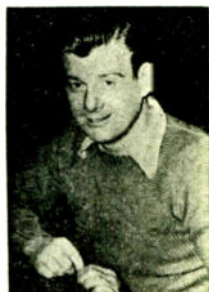
Sweater boy, 1941.