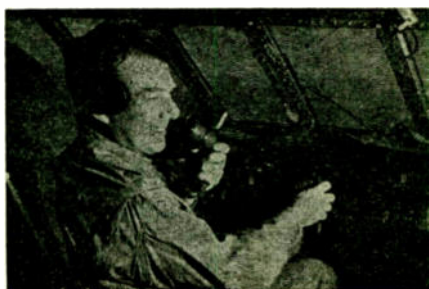
Flying high in 1949.