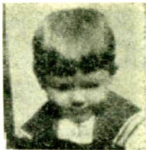
Five yrs., no sponsor.