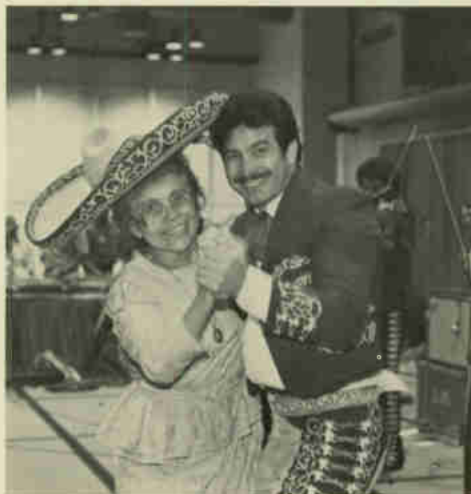
Ranchero star Tono Infante dancing with an audience participant during KLAT's Victory of Puebla festival.