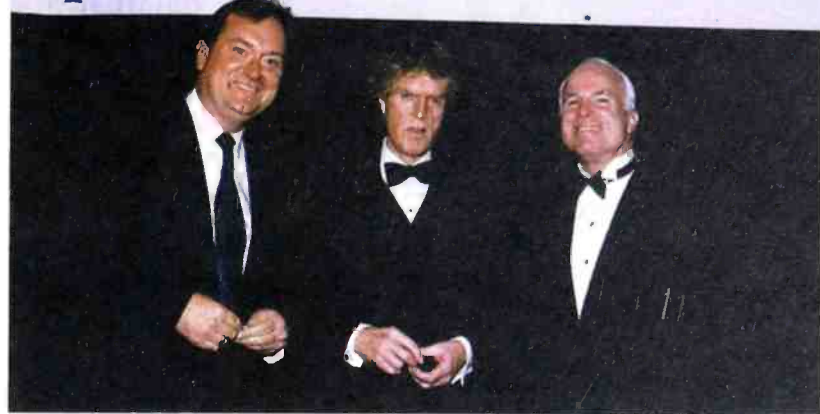
L-R: Tim Russert, Don Imus and Sen. John McCain (R-AZ) at a recent Imus roast in Washington, DC

products. But to try to hold him to that, you don't have any recourse as a consumer other than simply not going to the games. You have more of a recourse with political people, because you can not vote for them. That is a more dramatic and immediate impact on their tenure. I think that may be the essence of it.