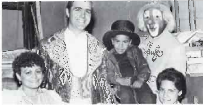
A few lucky circus attendees had a chance to meet the show's ringmaster.

For more details, contact Weiner at (215) 238-4894.