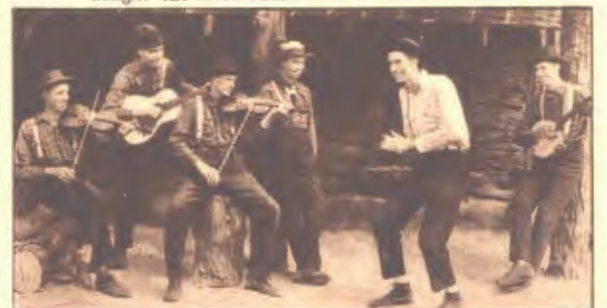
The Crockett Mountaineers, family of six, descendants of the famous pioneer, Davy Crockett, who, several evenings each week, delight the radio audience over C.B.S. stations.