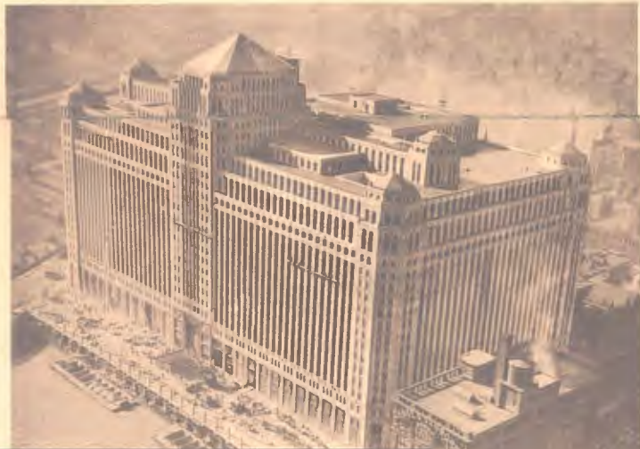
Left: Declared to be the world's largest building, this gigantic structure built by Marshall Field and Co. of Chicago, is planned to house a "City of Wholesalers" under one roof. An impression of the immensity of the structure may be gained by comparing it to adjacent buildings.