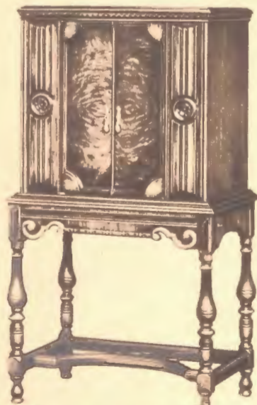
MODEL 92—Jacobean Highboy of American Walnut. Doors of Butt Walnut, matched both front and back; overlays of Australian Lacewood. Price $158.00 less tubes. Complete with Matched Majestic Tubes, $179.50. Only 49c a day for one year.

Join the Majestic Savings Club. Ask us about the convenient Majestic Savings Bank.