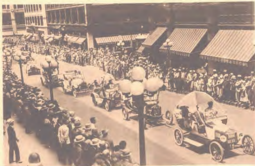
On the occasion of a visit to Kansas City by Amos and Andy, a whole parade of "Fresh Air Taxicabs" was formed in their honor—just another evidence of their popularity, and the warm feeling which exists from coast to coast for these fine young gentlemen.