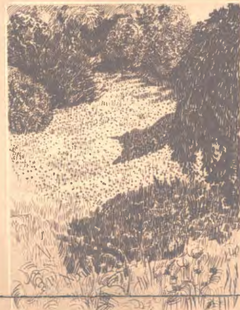
Above: Valued at $20,000 by art dealers, this drawing is one of the most prized articles in the modern art collection of Josef Van Sternberg, Hollywood movie director. The drawing, by Vincent von Gogh, viewed closely appears scattered and formless, but removed takes on the beauty of a delicate etching.