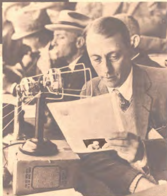
Below: Graham McNamee, crack radio sports announcer, who gave radio fans a colorful report of the famous annual Kentucky Derby race, recently held at Churchill Downs, in Louisville, Kentucky.