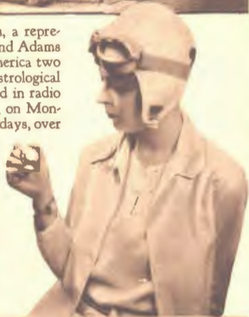
Right: Elinor Smith, Freeport's "Flying Flapper," one of America's foremost aviatrixes, has recently joined the broadcasting staff of the National Broadcasting Company.