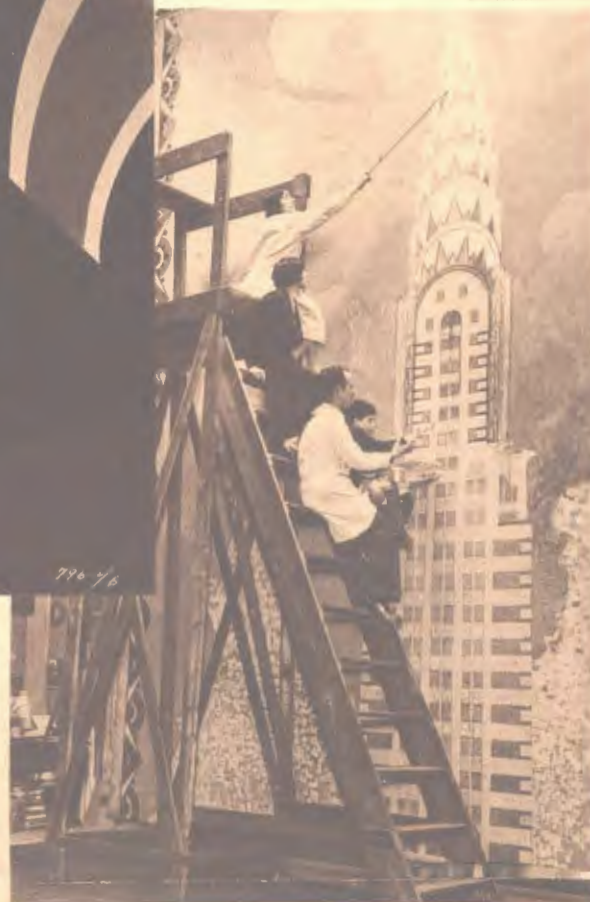
Bridal robes in blue—create the smart costume for the trip to the altar for 1930. Jean Arthur, screen star, wears such a costume in this charming photograph. The gown is created in steel blue velvet, and the veil of tulle is also in blue. Long gloves are worn and a sheaf of lilies are used for the bouquet.