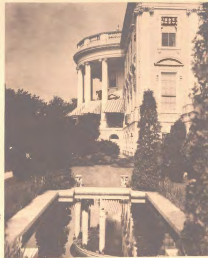
When summertime comes to the White House. A delightful corner of the private grounds of the Executive Mansion at Washington, where the calm waters of the lily pond reflect the classic outlines of the famous South Portico.