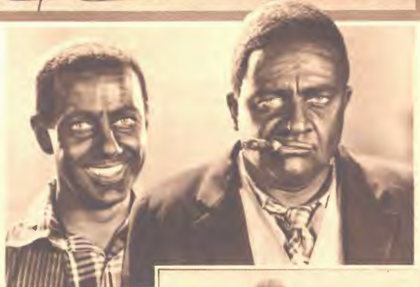
Here are Amos and Andy as they will appear when they are seen as well as heard. "The boys" are receiving the handsome sum of a half million dollars for putting their fun into celluloid, their first talkie, and in the meantime are continuing their nightly broadcasts.