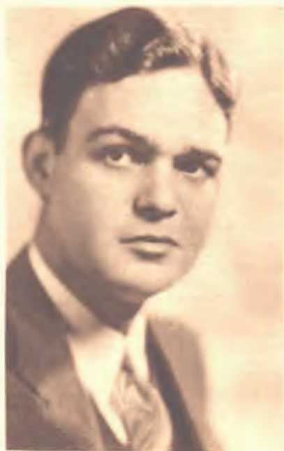
James Melton, first tenor of the famous "Revelers" Quartette.

JAMES MELTON . . . first tenor of radio's famous quartette "The Revelers," also known as "The Rovers" . . . was featured soloist with the Seiberling Singers . . . born in Moultrie, Georgia, just about twenty-six years ago . . . Melton never intended to be a singer until he reached college . . . by that time he was an accomplished saxophonist . . . he played with orchestras and bands at Florida University, University of Georgia and at Vanderbilt University, where he finished his senior year . . . other musical activities attracted his attention and he gave