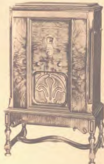
MODEL 93—Beautiful English design in American Walnut. Matched Butt Walnut center and side panels; overlays of genuine Australian Laceywood. Price less tubes... $146.00 Complete with Majestic Matched Tubes, $167.50. Only 46c a day for one year.