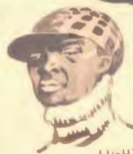
Among the fascinating characters in this radio treat are "The King fish," and his wife, "The Battleaxe," of the Great Home Bank