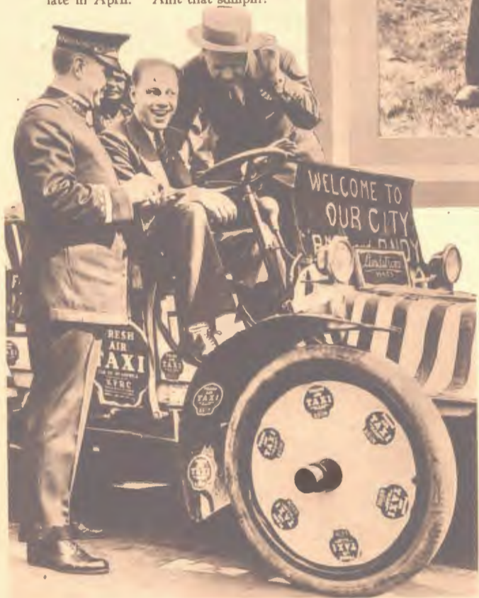
Left: Two of the principal members of that great fraternity, "The Mystic Knights of the Sea," on the receiving end of a ticket from the Po-lice.