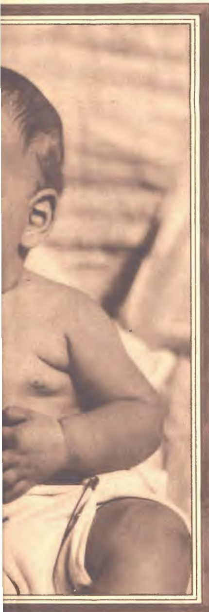
boring." This excellent piece of photography selected as the "Voice of the Air" PICTURE MONTH