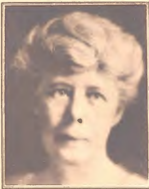
Carrie Jacobs Bond