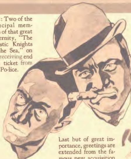
Left: Can you hear Andy saying, "Yes Sir, Mister, I is de President of de corpolation," "I'se regusted," etc., while Amos answers the phone with, "Dis yher is Amos," "Ya don't mean ta tell me."