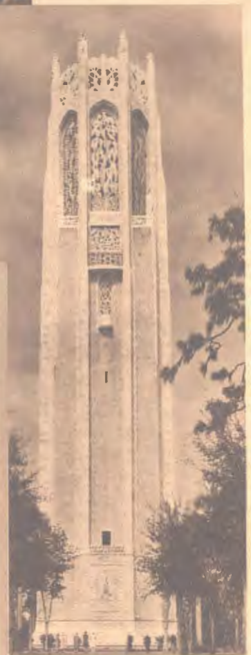
The beauty of the Bok Singing Tower near the city of Lakewood, Fla., portrayed by the cameraman. This masterpiece of art and architecture was a gift of the late Edward Bok and was dedicated in 1929 by President Hoover.