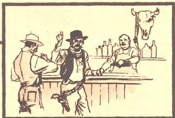
Cowboys sang in the bar rooms as well as on the prairie.