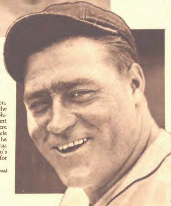
Right: Hack Wilson, famous slugger for the Chicago Cubs, National League pennant contenders, is here shown with the smile of triumph which he wears since he has passed last season's home run record for his league.