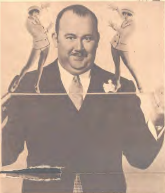
"Try this on your baton," says Paul Whiteman, Rajah of Rhythm. The dancers in this interesting composite pose are the famous European "Sisters G." Paul Whiteman and his orchestra are on the air every Tuesday evening at 9 o'clock, E. D. T., via C. B. S. stations and the Old Gold Hour.

Left: The officials of the Fresh Air Taxicab Co. of America, Incorporated; in conference. Amos 'n' Andy give some religious thought to a "propolition."