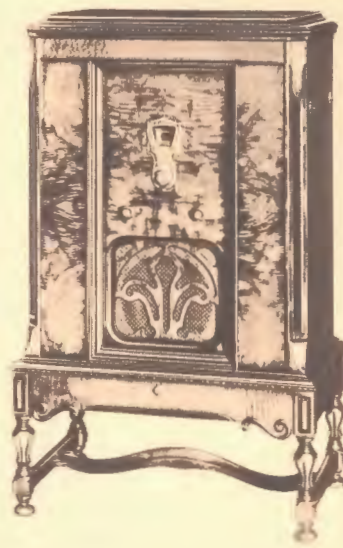
MODEL 102—Radio-phonograph combination in English design cabinet similar to Model 93. Compartment for two record albums. Price less tubes... $184.00 Complete with Majestic Matched Tubes, $205.50. Only 57c a day for one year.