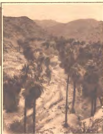
Above: PALM CANYON, CALIFORNIA—viewed from the rim of the canyon. The mountain peak in the background is an estimated distance of 50 miles away, indicating the clarity of the atmosphere. By H. S. Meily, Huntington Park, Calif. (Prize Award $3.00.)