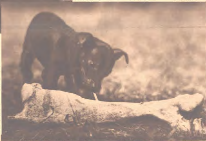
Right: This midget canine in his attack on what appears to be a portion of a dinosaur skeleton expresses graphically the apex of ambition. A. D. Terrenson's camera snapped this, the most interesting animal picture of the month.