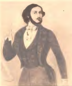
Louis Antoine Jullien