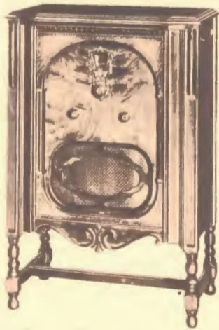
MODEL 91—Graceful Early English design in American Walnut. Matched Butt Walnut center panel overlaid with genuine Australian Lacewood. Price $116.00 less tubes. Complete with Majestic Matched Tubes, $137.50. Only 38c a day for one year.