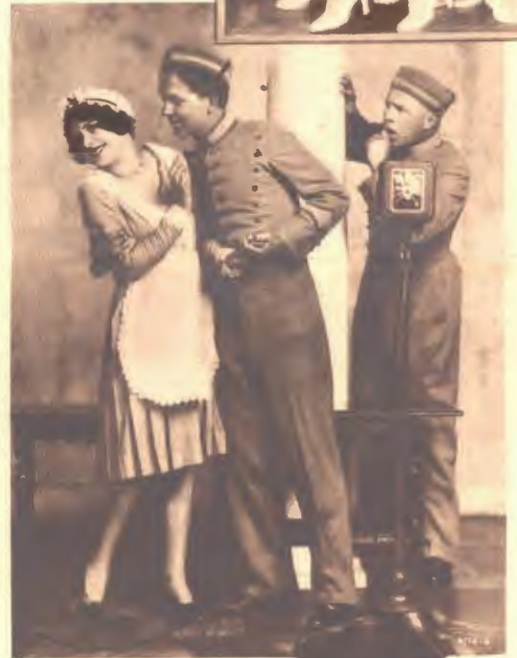
Below: "Say! That's my girl." A scene from "Hoppin' Bells," N. B.C. feature, broadcast each Tuesday evening at 8:45, E.D.T.