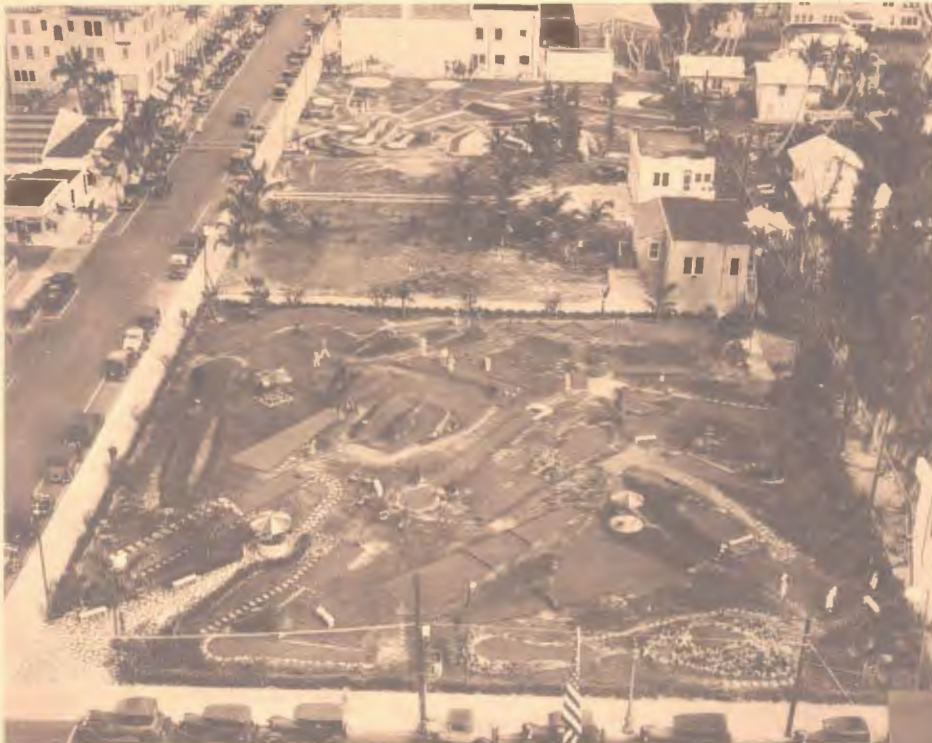
The "Tom Thumb Golf Course," popular at winter resorts during the last season, is rapidly springing up throughout the country. The miniature course above, photographed at Palm Beach, Florida, is known as "Sunnylinks."