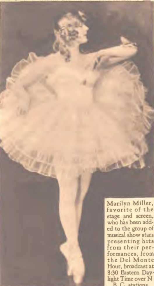
Marilyn Miller, favorite of the stage and screen, who has been added to the group of musical show stars presenting hits from their performances, from the Del Monte Hour, broadcast at 8:30 Eastern Daylight Time over N. B. C. stations.