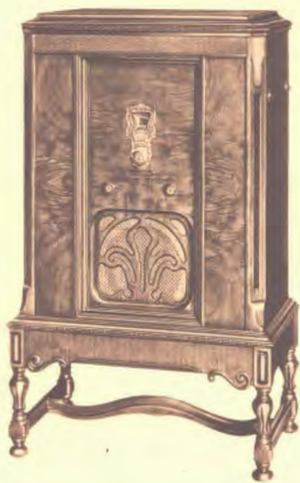
MAJESTIC 93—An exceptionally rich cabinet with powerful balanced-circuit radio and sensitive Colotura Speaker. Price, complete with Majestic Matched Tubes..... $177 50