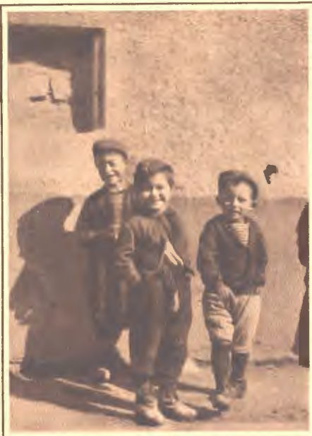
Above: "FROGS"—street gamins in Cry, France.