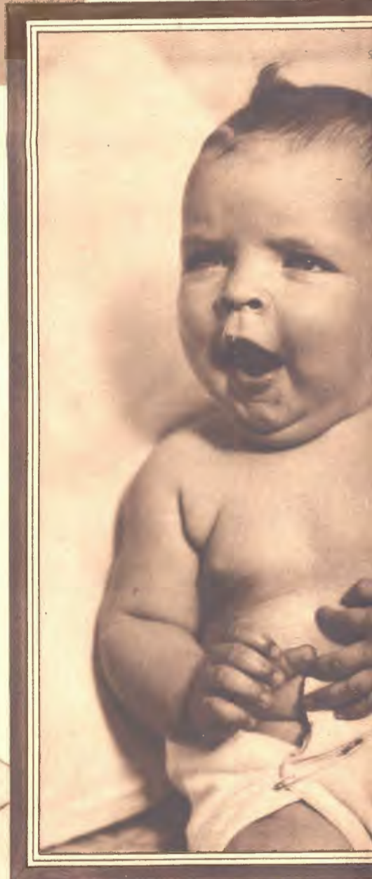
"Ho-hum. This life of idleness is becoming positively boring. and has been selected by the National Geographic Society as one of the most interesting photographs of the month.