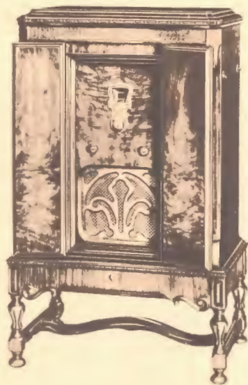
MODEL 103—Radio-phonograph combination in American Walnut. Genuine Laceywood overlays. Counterpoised Lid. Compartment for two record albums. Price less tubes... $203.50 Complete with Majestic Matched Tubes, $225.00. Only 62c a day for one year.