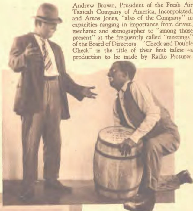
Andrew Brown, President of the Fresh Air Taxicab Company of America, Incorporated, and Amos Jones, "also of the Company" in capacities ranging in importance from driver, mechanic and stenographer to "among those present" at the frequently called "meetings" of the Board of Directors. "Check and Double Check" is the title of their first talkie—a production to be made by Radio Pictures

Amos takes orders from "The President of de Company," and baits his hook, but "I ainta gona do it," is his answer to all orders concerning his savings