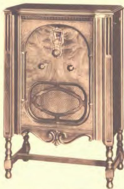
MAJESTIC 91—A radio of tremendous power and perfect Colorful Tone, in a beautiful cabinet of Walnut and Lacewood. Price, complete with Majestic Matched Tubes..... $147 50