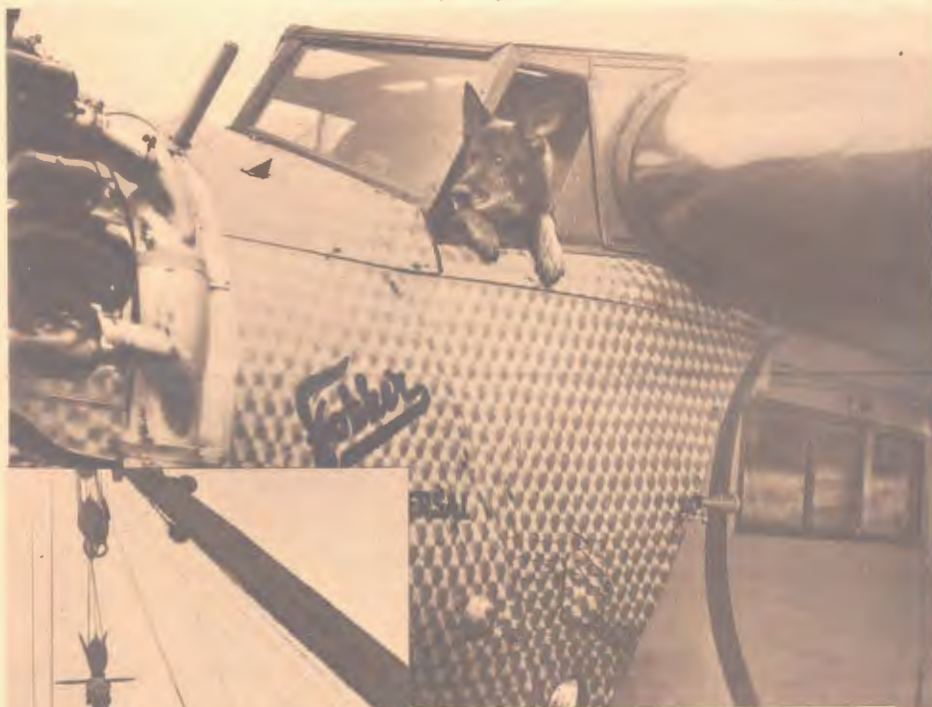
Rin-Tin-Tin becomes air minded. The famous Thespian canine is in the plane which rushed him from Toronto to New York so that he could fulfill a vaudeville engagement contracted for.