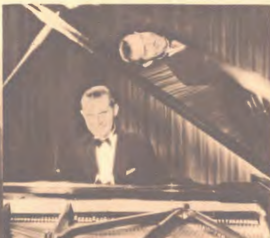
Playing a dual role, so to speak, is "Whispering" Jack Smith, celebrated radio entertainer, in this unusual photograph.

Below: Olive Palmer, charming soprano, forsook the grand opera stage to devote her talents to radio, and now has one of the most enthusiastic followings of any radio singer. She sings every Wednesday on the Palm Olive Hour from N. B. C. stations at 9:30 P. M. E. D. T.