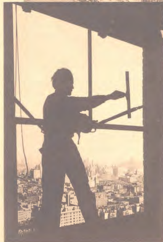
Left: Dangerous? Yes, but it is just in the day's work for the window washer. Sometimes they fall, but their occupation probably is safer than coal mining. They are required by law to wear safety belts. This remarkable photograph was snapped during spring house cleaning of the Graybar Building, New York.