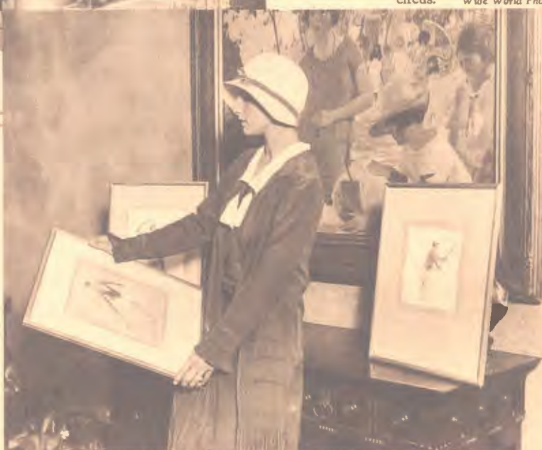
A most versatile young lady is Helen Wills Moody, for she is not only the world's champion woman tennis player, but also an artist of ability. Here she is seen looking over some of her drawings on exhibit at the Grand Central Art Galleries, New York. She is soon to defend her Wimbledon and French court titles.