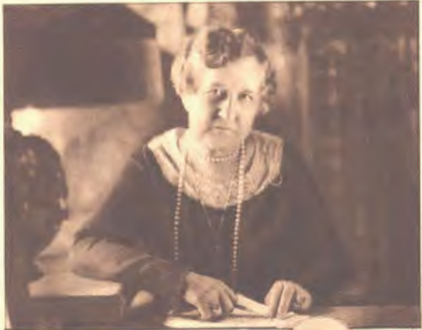
Above: Evangeline Adams, a representative of the New England Adams family which has given America two presidents, who is an astrological authority and may be heard in radio broadcasts at 7:30, E.D.T., on Mondays, Wednesdays, and Fridays, over C.B.S. stations.