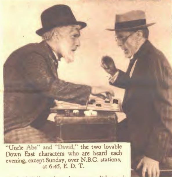
"Uncle Abe" and "David," the two lovable Down East characters who are heard each evening, except Sunday, over N.B.C. stations, at 6:45, E. D. T.