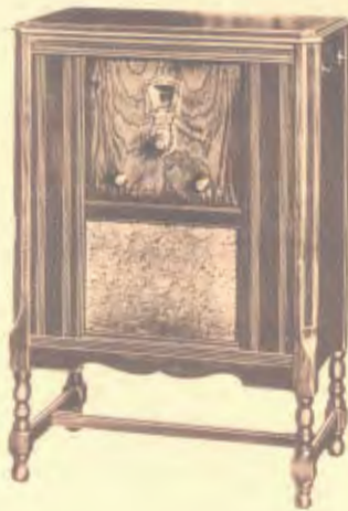
MODEL 90—Compact Tudor design in American Walnut. Grained Butt Walnut center panel. Colotura Speaker opening covered with special brocade. Price $95.00 less tubes. Complete with Majestic Matched Tubes, $116.50. Only 32c a day for one year.

Below: Mary and Bob, one of radio's most famous couples whose itinerant adventures, recounted through their repartee, contributes to the interest of the True Story Hour, broadcast over the Columbia chain at 9 P.M. Eastern Daylight Time.