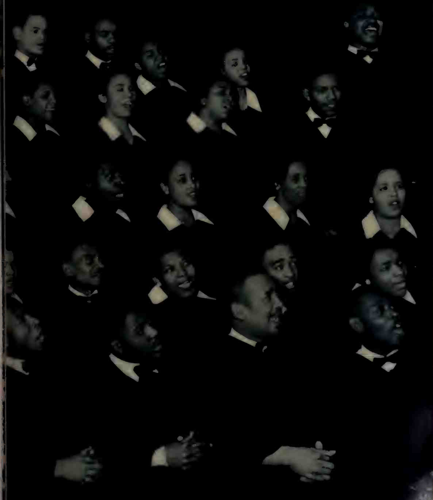
"Wings Over Jordan"