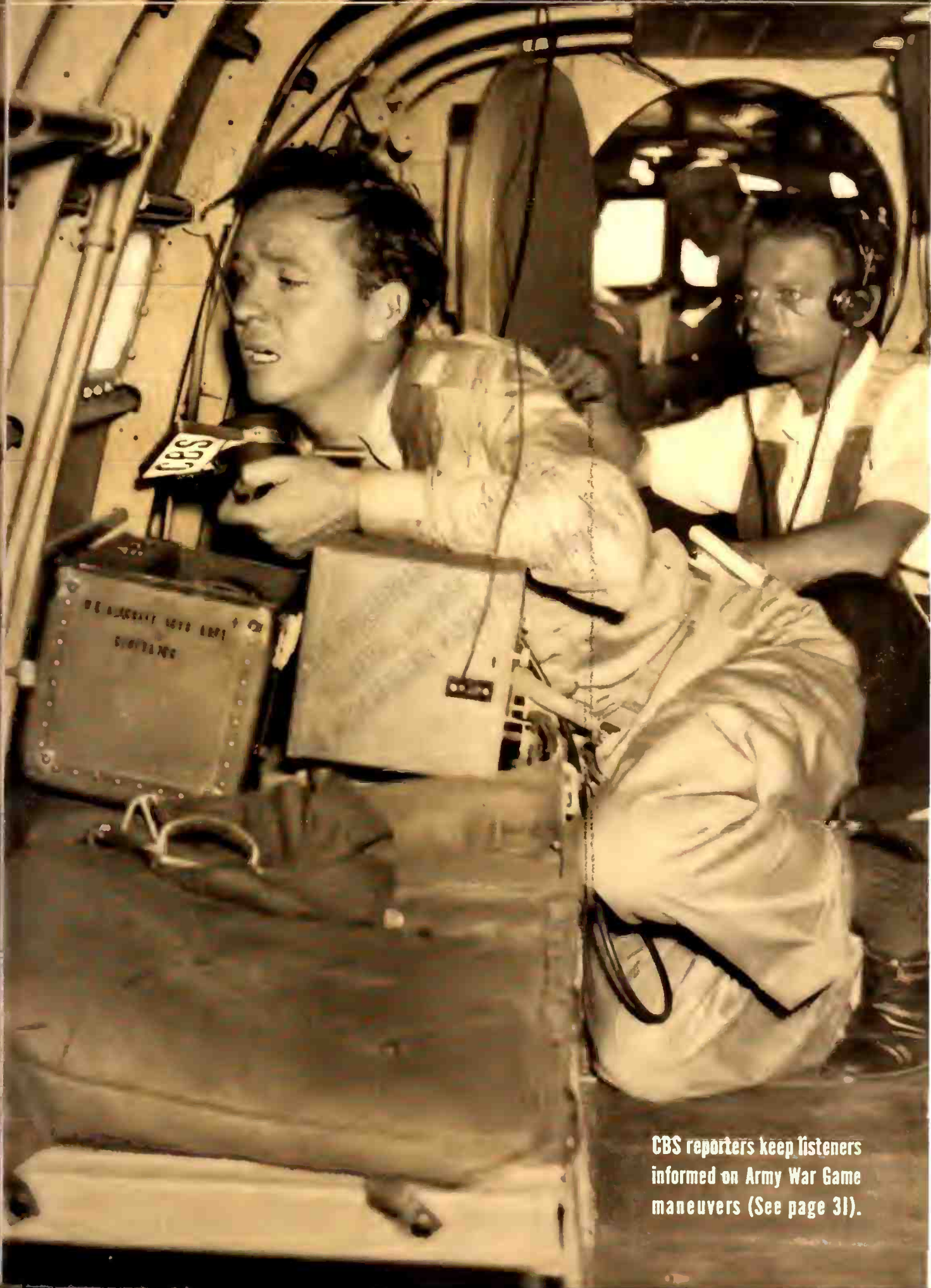
CBS reporters keep listeners informed on Army War Game maneuvers (See page 31).