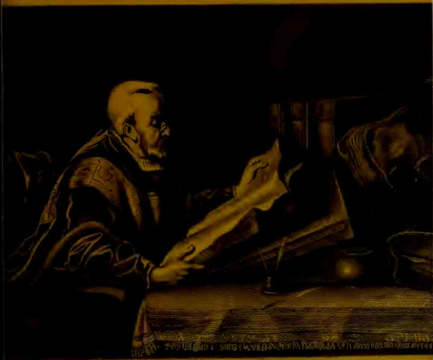
INVITATION TO LEARNING — CBS' weekly half hour of discussion and talk about the world's greatest books (See Page 25)