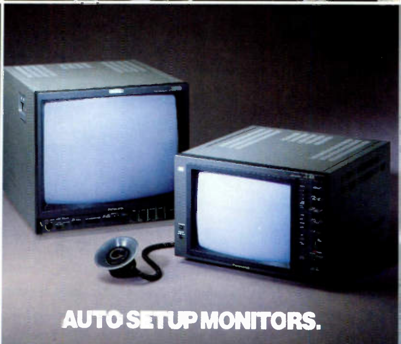
AUTO SETUP MONITORS.