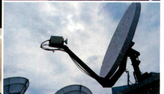
With the launch of SBS-6, Hughes Communications will ensure Ku-band capacity into the 21st century.

Hughes Communications means satellite service that's right for your business. No matter what you need. Or when you need it.