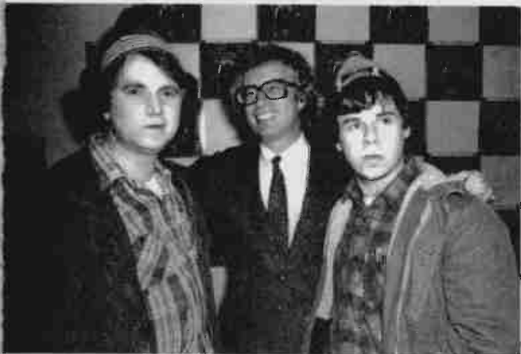
Canada's famous Hosers with the Canadian Consulate General Ken Taylor at a Canadian Consulate press reception (Dec 22) in New York City. On tap is a Rolling Stone interview.