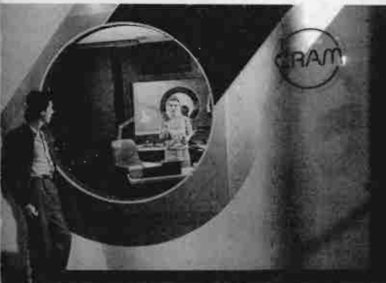
Blondie star Debbie Harry spent a day in the studios of CKEY in Toronto but not to plug her record product. This is a scene from David Cronenberg's latest movie Videodrome in which she stars.