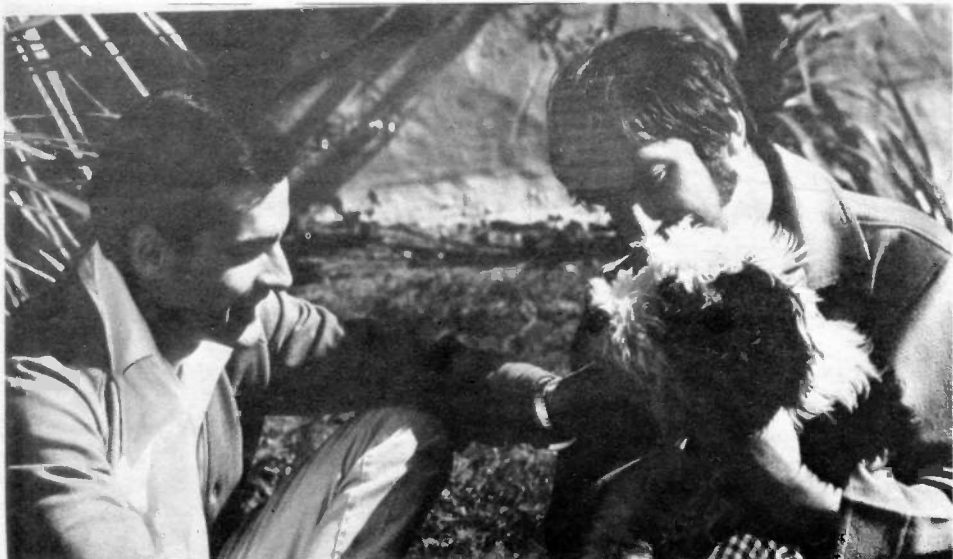
Photographer Pat LaCroix (L) talks to Denny Doherty of The Mamas and Papas in LA.

on Aug 23. Whether you're a hard core rock and blues fan or just interested in intelligent dumb animals, you can blow your mind at The Moscow Circus when it hits the Gardens from Sept. 26 right through to practically ice time, Oct. 1. But just before the sawdust show there'll be the Second Annual Toronto Sound Show from 10 AM to Midnight on Sept. 16.