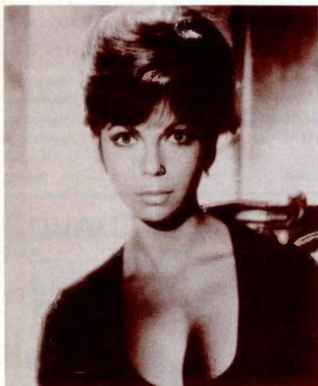
Nancy Sinatra tops the RPM Top Forty this week with "These Boots Are Made For Walking" on Reprise.