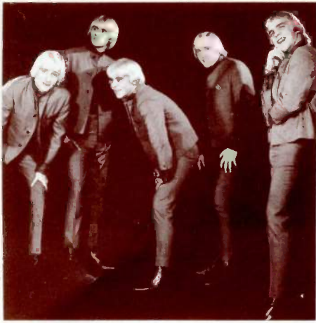
Popular Montreal based group Les Houlopes Tetes Blanches.