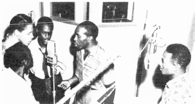
Capitol's Cues gather mikeside to make second record for label, "Charlie Brown" on the "A" side, "You're On My Mind" backside. "Brown" is up-tempo novelty with strange new vocal sounds, other song blues ballad.

The composer collected others from a Turkish dry cleaner, a Welsh engineer, a Greek candymaker, and an Hawaiian guitarist.