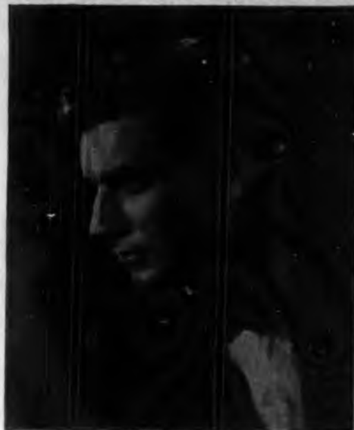
LEONARD BERNSTEIN Conductor of the New York City Symphony

sively November 17th, December 1st, 15th, 22nd and January 5th. A special Brahms anniversary program will be presented November 17th.