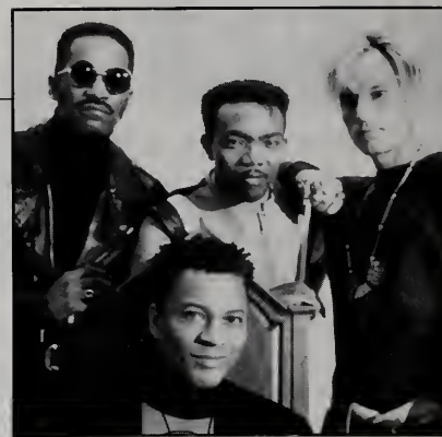
To Watch: London Beat #45