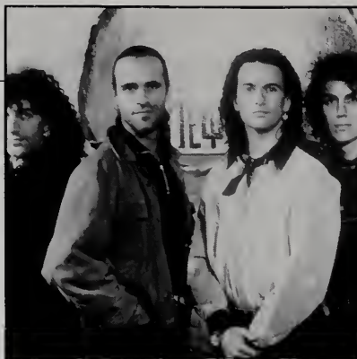
High Debut: The Escape Club #74