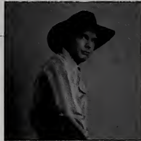
To Watch: Garth Brooks #18