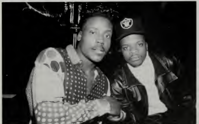
Backstage at Ready For The World video shoot at the Palladium in Hollywood, California are group member, Melvin Riley, and close friend, Ricky Bell of Bell Biv DeVoe.

GET THIS!... Rob and Fab (ex-Milli Vanilli members) got $200,000 for filming a Care Free gum commercial imitating opera singers... Terry Lewis of the famous producing/writing team "Jimmy Jam + Terry Lewis" has said "I do" to Warner Bros. recording artist Karyn White... Here is an interesting combination—Tone-Loc and El DeBarge, yes, you heard it right. The two have teamed up for a recording that has the inside industry buzzing.