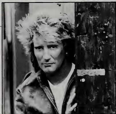
#1 Single: Rod Stewart