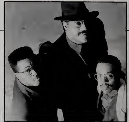
To Watch: Surface #40