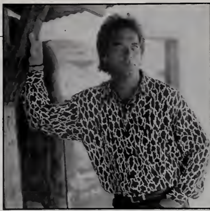
High Debut: Huey Lewis #46

(G) = GOLD (RIAA) Certified (P) = PLATINUM (RIAA) Certified