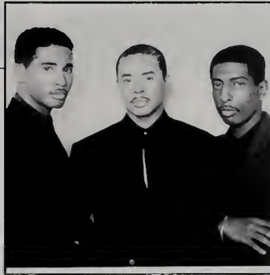
High Debut: After 7 #48