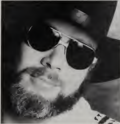
Hank Williams, Jr.