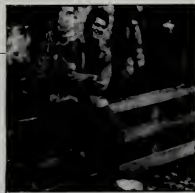
#1 Single: Randy Travis