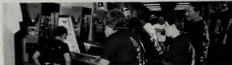
This photo depicts some of the numerous conventioners who participated in the Bally Harley-Davidson pinball tournament.