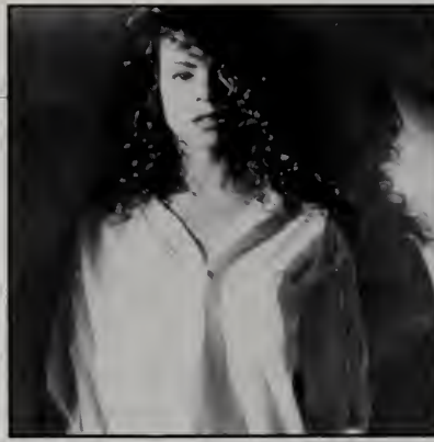
High Debut: Mariah Carey #51