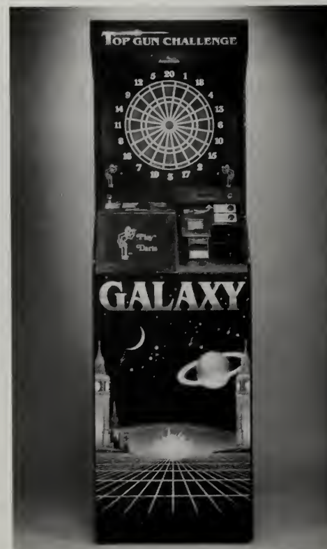
English Mark Darts Galaxy

Further information regarding the numerous advantages and time-saving aspects of the Galaxy concept may be obtained by contacting Arachnid, Inc. at 6421 Material Ave., P.O. Box 2901, Rockford, IL 61132-2901.