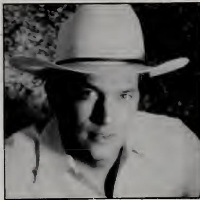
High Debut: George Strait #141

(G) = GOLD (RIAA Certified) (P) = PLATINUM (RIAA Certified)