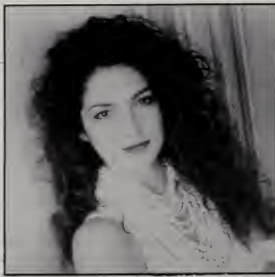
#1 Single: Gloria Estefan