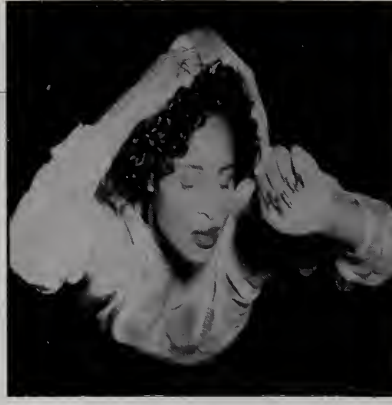
High Debut: Innocence #68