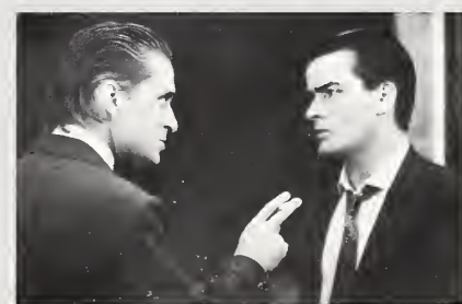
Michael Douglas and Charlie Sheen in Wall Street

Also to be released is Dark Eyes starring Marcello Mastroianni, who received an Academy Award nomination for his performance. Directed by the Soviet Union's Nikita Mikhalkov, Dark Eyes is a funny, bittersweet story of a man who must find his own way, after compromising his ideals. It is based on short stories of Anton P. Chekov.