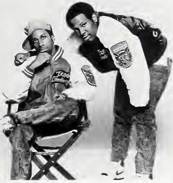
Rob Base & DJ E-Z Rock

"Rock the Beat." Put together as a mark, the single became the star of the collection.