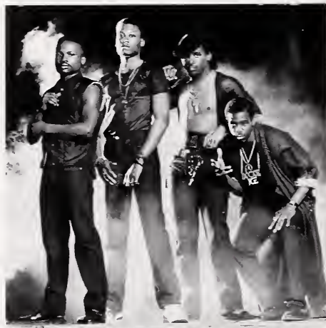
UTFO - Select Records artists UTFO pictured (l-r) The Educated Rapper, Mix-master Ice, The Kangol Kid, Doctor Ice.