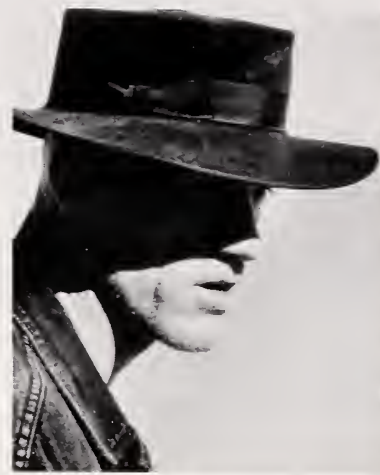
Midnight Oil's Peter Garrett

LOS ANGELES - With the release of their sixth album, Diesel And Dust (Columbia), Sydney, Australia's Midnight Oil are finally receiving the U.S. recognition that they so richly deserve.