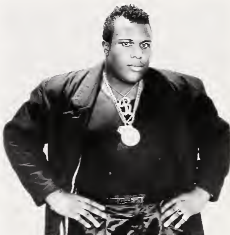
Chubb Rock on Select Records