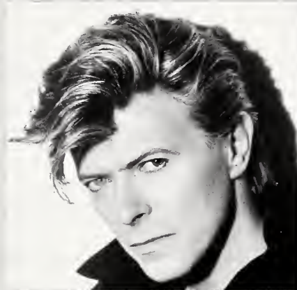
David Bowie - David Bowie stars in Glass Spider

VSDA ADOPTS NEW ANTI-PIRACY LAWS - The Board of Directors of the Video Software Dealers Association (VSDA) has amended its by-laws in accordance with its growing involvement in anti-piracy operations. The new guidelines specify strict measures for approving new VSDA memberships. They provide the Board with the ability to suspend current VSDA members based on a prior or future civil or criminal suit involving video piracy. Contact the VSDA for further details (609) 596-8500. The VSDA Piracy Hotline is (800) 257-5259.