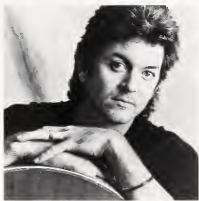
Rodney has returned to his country roots and hope that listeners are too.

Ah, the love that binds... You know when you got it bad if you can't let that special someone out of your sight, much less leave them altogether! That's the love that Crowell croons about here. It's an upbeat song and with sparse instrumentation, just the basics: steel guitar, piano and violins. Crowell wrote and helped Tony Brown with the production as well. We're glad