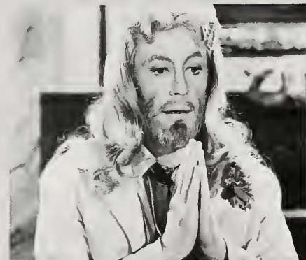
HELP... - Please, Lord, not another Sunday without football...