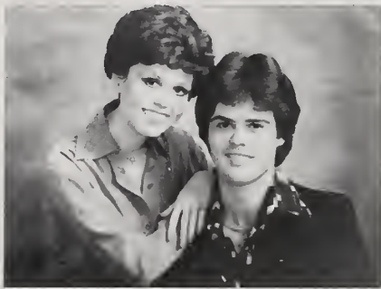
DONNY & MARIE OSMOND - The early years.