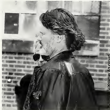
Same Look, New Sounds - Singer/songwriter Kris Kristofferson, recovered from knee surgery and back to daily jogging, stopped in to play a few selections from his forthcoming album. The new sound of tracks like "Eagle and the Bear" was well received by the crowd in Lincoln. Kristofferson begins filming in Santa Fe on a new film, Dead or Alive this fall, and hopes to release his new album early in 1988.

While Farm Aid III was a one-day television success, with Dick Clark Productions achieving superior results on video, the still photographers sent to cover the event found their original access parameters drastically revised. At the show, photographers were restricted to shooting from three prescribed locations. None of these really facilitated their needs, and all of which required the most sophisticated of lenses in order