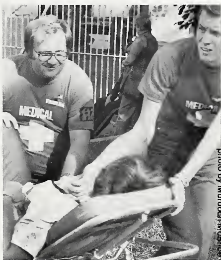
Agony of Defeat - Unconfirmed reports identified the patient in this picture as a still photographer at Farm Aid III. While many photographers were surprised by the limited access near the stage, few took it this seriously. In fact, the event was the smoothest of all Farm Aids, with very few problems.

There have been rumors that this may have been the last Farm Aid. Even Willie Nelson has hinted at the tremendous burden of coordinating the effort. Last year at Farm Aid II, reknowned for its hot weather and accessible, party atmosphere, Nelson encouraged younger artists to become more involved in the struggle to save family farming in this country. The odds against farmers are so great that they are hard to believe - Farm Aid executives claim that 200 family farms go under every day.