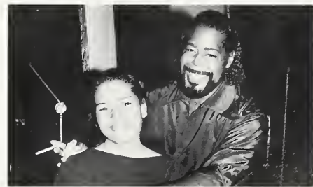
TEEN DREAMS - Debbie Gibson recently performed "Only In My Dreams" on American Bandstand, where she got to meet fellow teen idol Dick Clark.