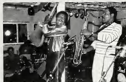
BURN IT! - During a New York boatripe this summer, Albert Collins, the nasty blues guitar picker, was joined by David "Fathead" Newman, the nasty blues tenor blower, for a nasty little jam.

FUND TIME - The National Academy of Jazz has established a Woody Herman Foundation Fund, "with Woody's support and blessing," to be used to assist other jazz musicians in need of financial assistance. The administrative details of the fund are currently being worked out, but tax-deductible donations are being accepted. Checks should be made out to the "Woody Herman Foundation Fund" and sent to the NAJ office at 4475 Vineland Ave., North Hollywood, CA 91602.