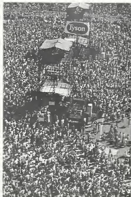
Press Box View of Farm Aid III - More than 70,000 people attended the benefit for family farmers. Approximately $3.3 million was raised, and as much as $1.5 million could go to needy farmers.