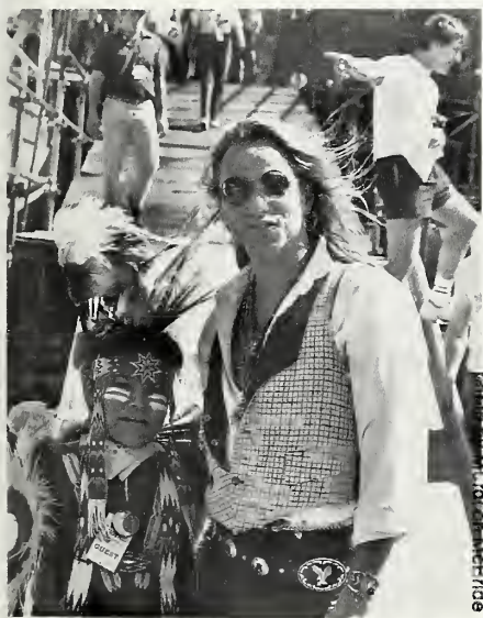
All's Forgiven - Mick Jones from the Unforgotten poses with a native American Indian youth early in the Farm Aid program. The success of Willie Nelson's benefits can be traced to his ability to bring together all sorts of performers, representing all types of music and aspects of American culture.

Beyond the frustrating aspects of producing or covering such a show, there were memorable performances by many celebrated artists. Perhaps the most touching statement was made by Neil Young, who incorporated the first half of an acoustic number he'd written about the plight of family farmers into his set. Stopping mid-way in the piece, Young said, "I haven't finished this song, because the family farmer isn't finished yet."