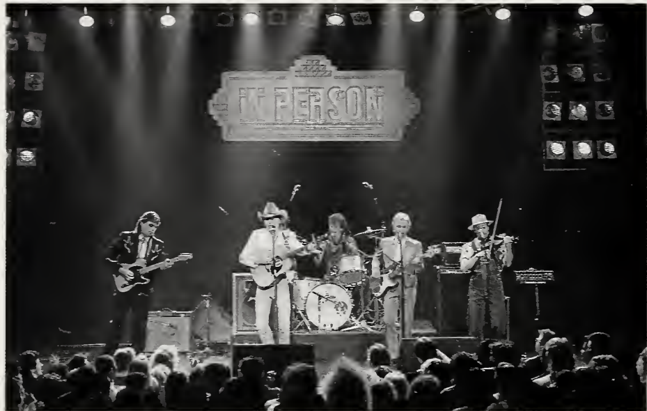
HILLBILLY DELUXE - Dwight Yoakam showed up to jam on In Person From The Palace , the CBS Network's Late Night series. His segment aired August 21.