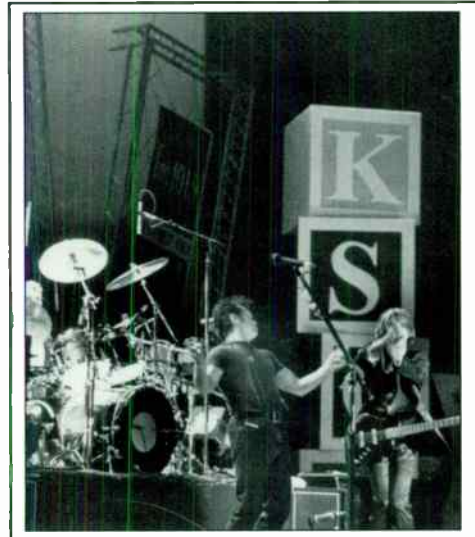
John Mellencamp onstage at KSCA's Christmas/Toys For Tots Concert