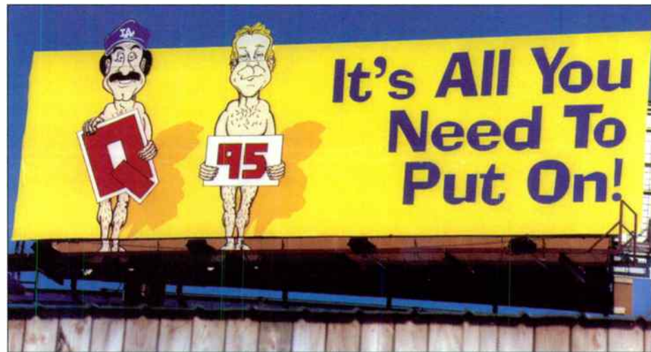
Album WFBQ Indianapolis-based syndicated morning men Bob and Tom reveal their new stripped-down billboard campaign.