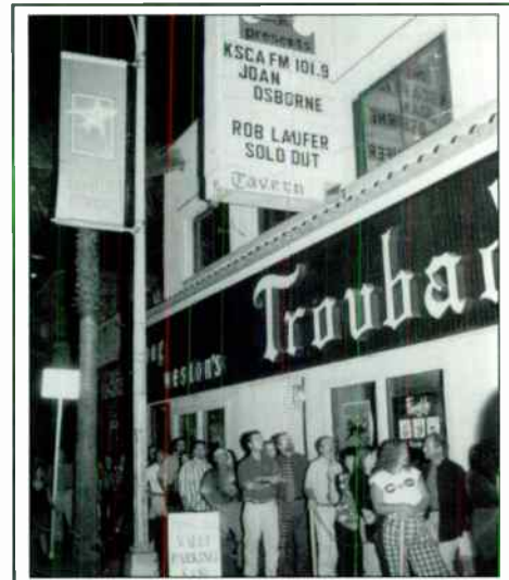
A line of KSCA listeners wait to get into sold-out Joan Osborne show.