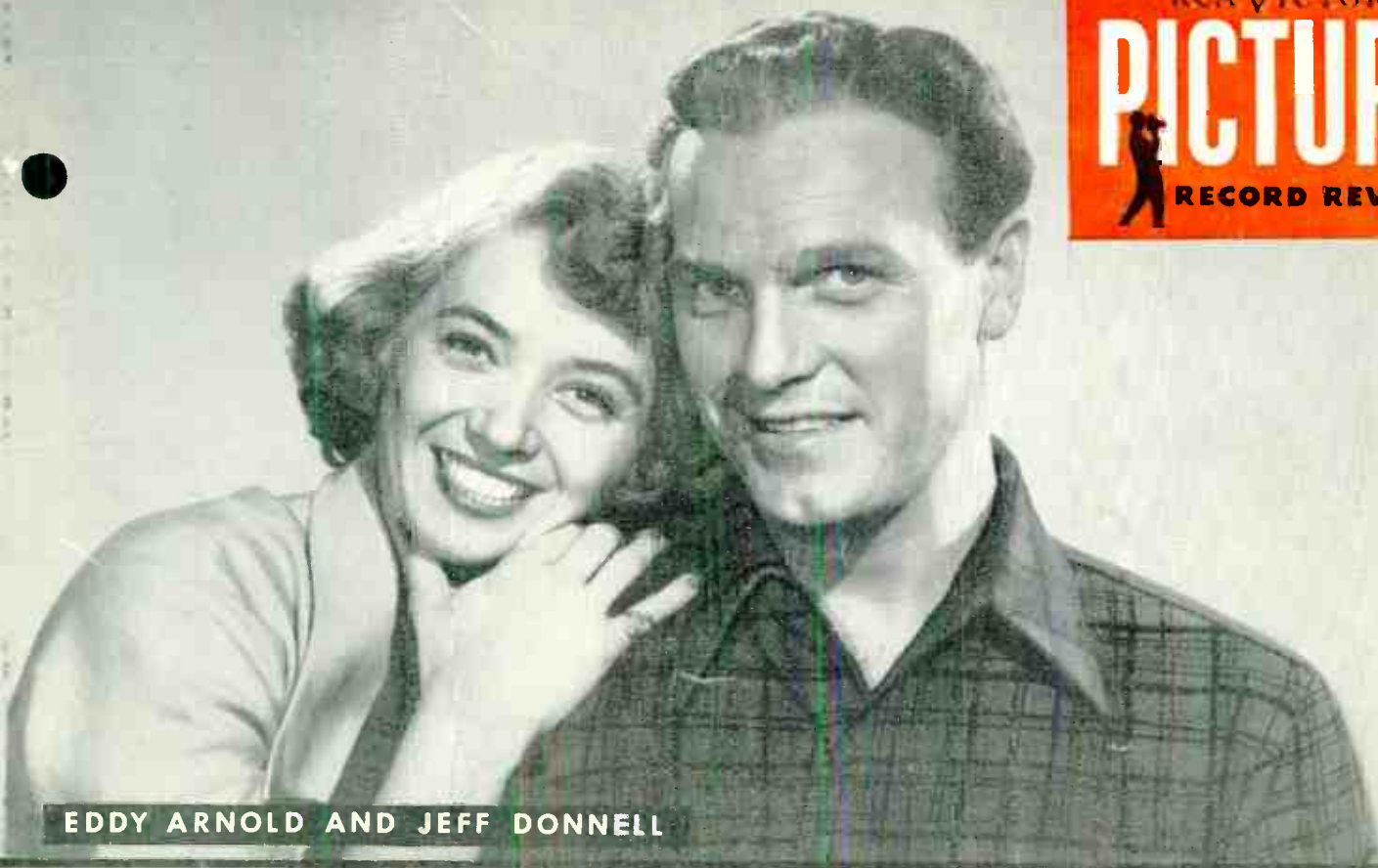
EDDY ARNOLD AND JEFF DONNELL