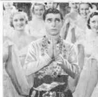
1935 "Kid Millions" was one of Cantor's most successful motion pictures.