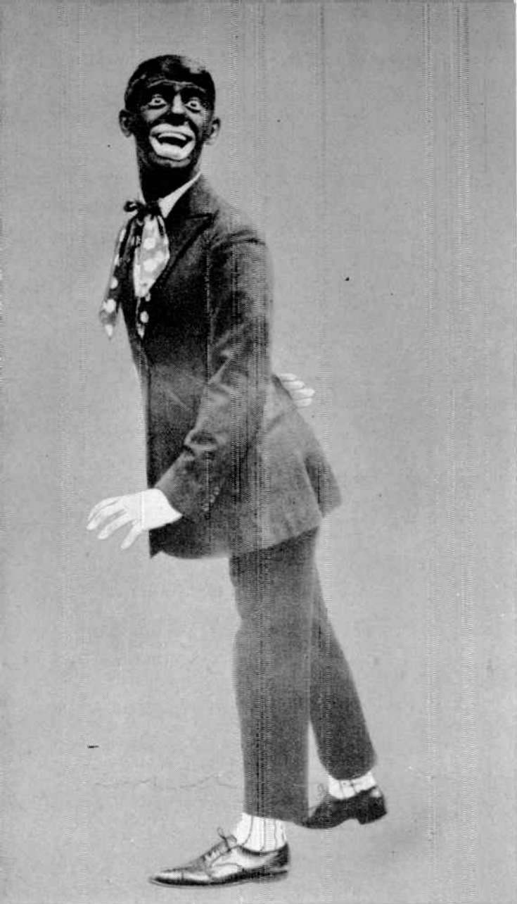
1917 During First World War Eddie Cantor appeared in the Ziegfeld Follies. This picture was most popular pose of Eddie, who made "That's the Kind of a Baby for Me" the big hit of the show.