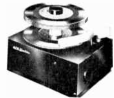
The swing's to "45" Plug in attachment

PHIL HARRIS—Play a Simple Melody Phil comes up with this old Irving Berlin tune and records it in a novel way. He does a duet in which he sings both parts. This is done by recording one part of the tune first, then making the other part, then dubbing the two into one. This trick makes Phil's version of "Simple Melody" just about tops.