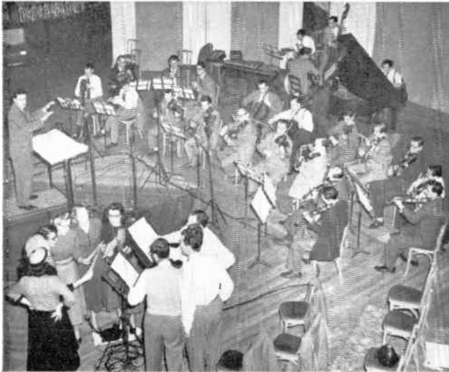
HUGO WINTERHALTER RECORDS WITH HIS ORCHESTRA & CHORUS