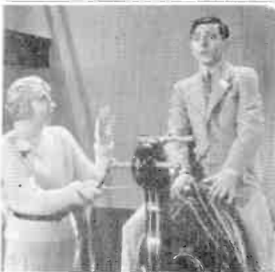
1931 Goldwyn's "Palmy Days" with Charlotte Greenwood.