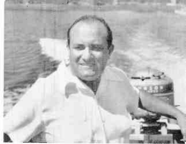
LEONARD WARREN , back from Mexico, rides boat on lake near Connecticut home. (His best seller: Toreador Song: "Carmen.")