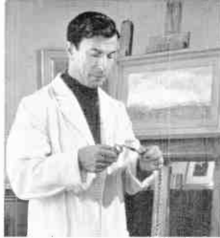
NATHAN MILSTEIN , concertizing in Europe will work on several paintings. (Disc: Stravinsky's "Russian Maiden's Song.")