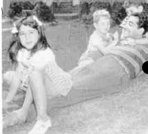
ROBERT MERRILL , seen at Long Island home, appears in San Francisco from July 23 to Aug. 6. (Disc: "The Lord's Prayer")