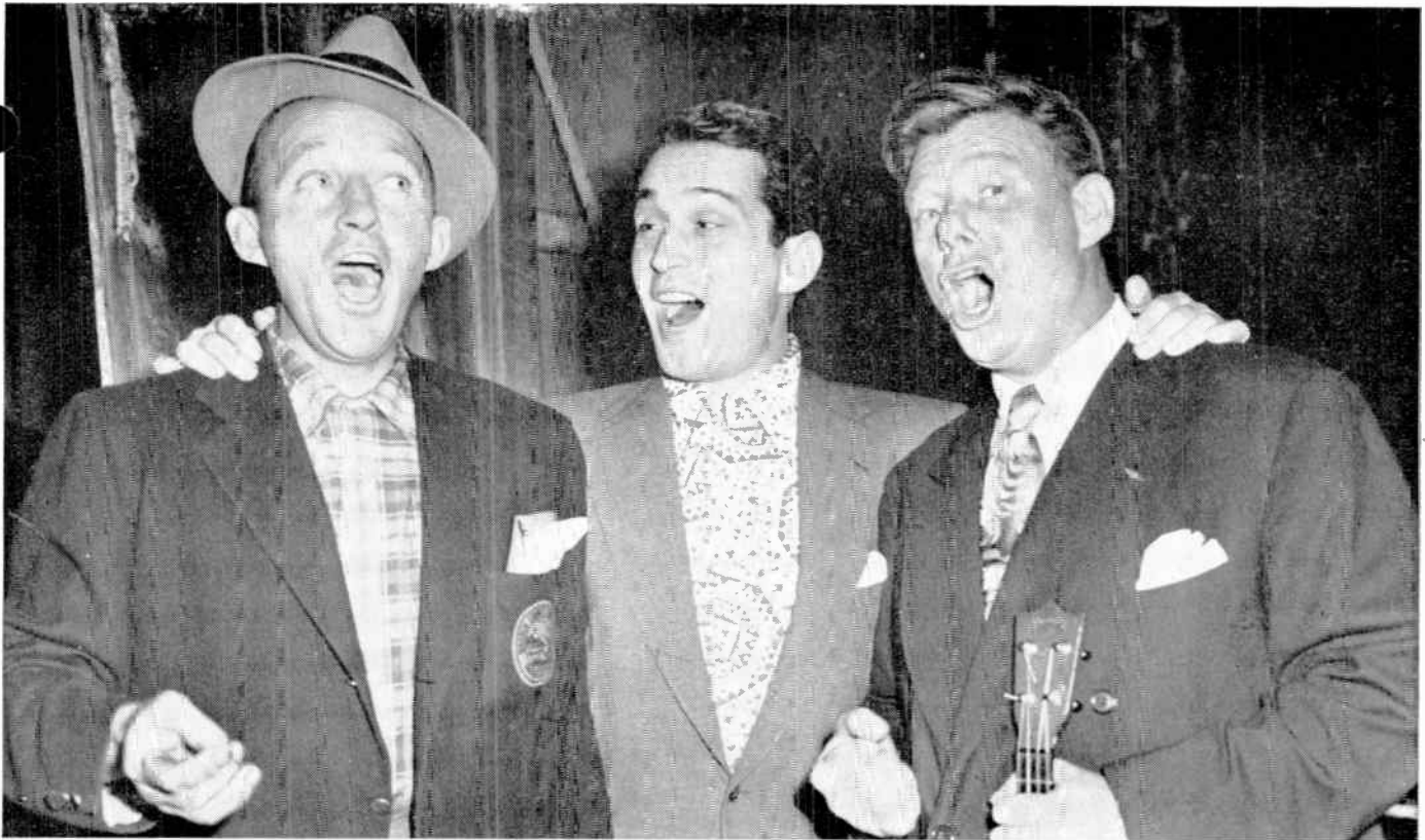
BING CROSBY, PERRY COMO AND ARTHUR GODFREY REHEARSE "DEAR OLD GIRL," THE SONG THEY SANG TOGETHER ON CHICAGO RADIO SHOW