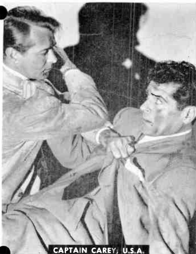
CAPTAIN CAREY, U.S.A.

film's villains. This John Ford production has a score by Stan ("I'm in the Sky") Jones which is sung on the sound track by the Sons of the Pioneers. Two of the tunes from the movie—"Rollin' Dust" and "Wagons West"—are on a new Sons record.