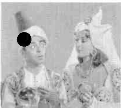
1936 With Gypsy Rose Lee in "Ali Baba Goes to Town."