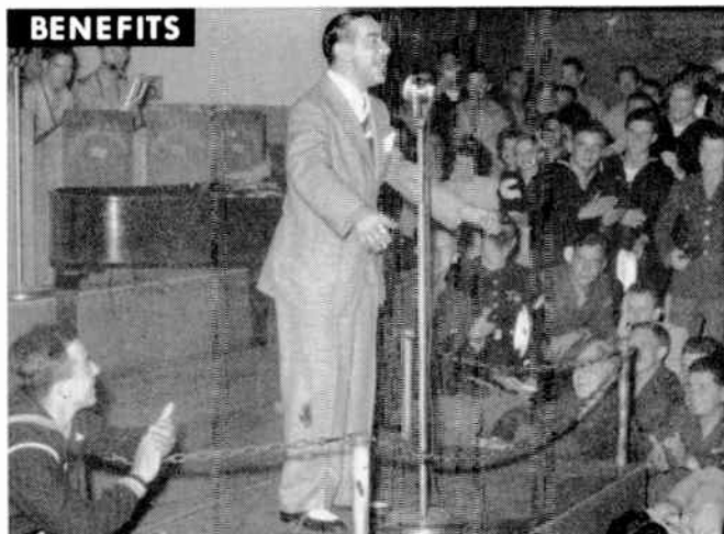
1942 found Eddie indulging in his favorite activity—appearing for worthy causes, free of charge. This shot was made at the famous Hollywood Canteen where Cantor was active during war.