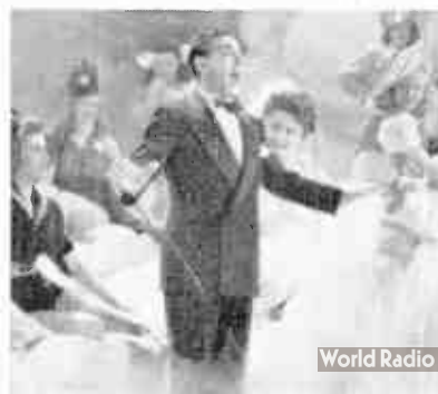
1943 "Thank Your Lucky Stars" was war time movie with big cast.