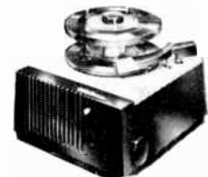
The swing's to "45" Victrola 45EY