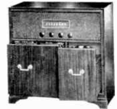
The swing's to "45" Victrola A55

Exceptional quality of piano tone is captured here, as Rubinstein plays with crystal clarity and discernment this warm and lyrical work from Beethoven's early period. There are impressive sonorities without the slightest suggestion of pounding. Warm, lyric tone, delightful phrasing mark the Schubert.