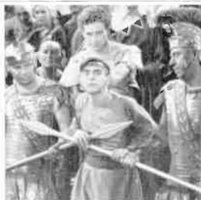
1933 Eddie's second movie was for Warner. It was "Roman Scandals."