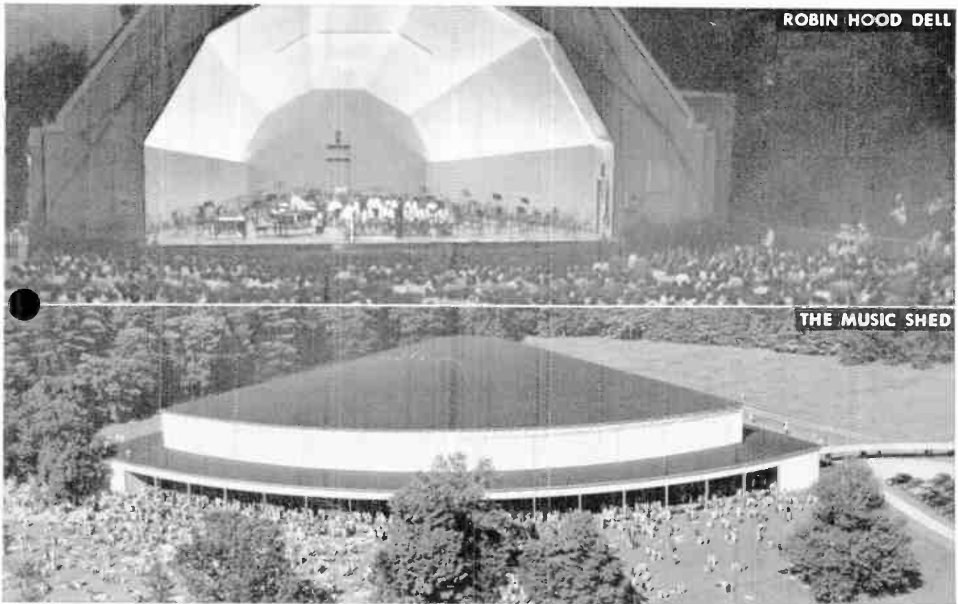
ROBIN HOOD DELL