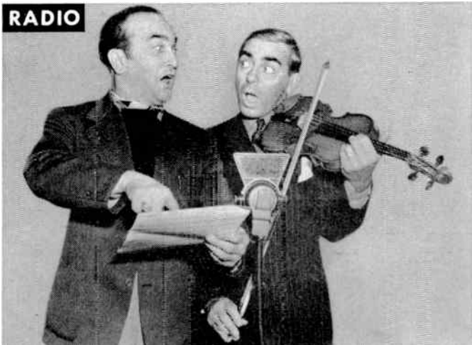
1931 was the year that Eddie started the radio program on which he later introduced Deanna Durbin, Bobby Breen, others. Here, he's seen with Rubinooff, who was his foil for years on show.