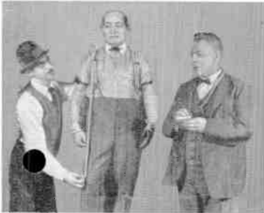
1922 This is the "Joe's Blue Front" sketch from "Midnight Rounders," a Shubert revue.