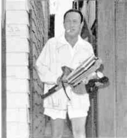
JASCHA HEIFETZ , back from England, plays tennis at Malabu Beach. (Album: Mendelssohn's "Concerto in E Minor, Op. 61.")