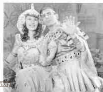
1945 Joan Davis became Eddie's movie partner in "Show Business."