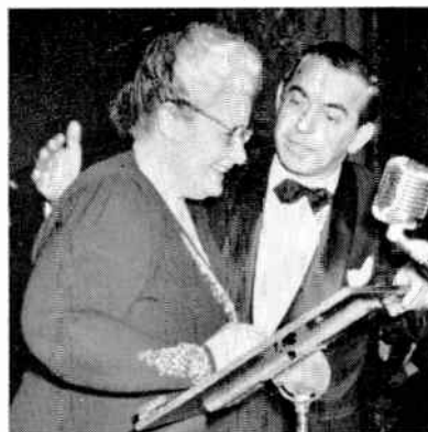
1950 Mary Margaret McBride presents Eddie Cantor with One World Committee award at Carnegie Hall.