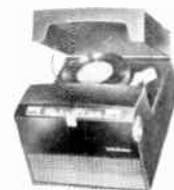
The swing's to "45" Victrola 9Y51

HUGO WINTERHALTER and THE FONTANES SISTERS—I Wanna Be Loved This is the kind of tune that was popular ten years ago, the slow romantic melody that says all the things that a love song ought to say and says them softly and well. There's been a woeful lack of convincing love songs the past few years but this one does the trick. Winterhalter's arrangement is tasteful and ideally suited to the tune and the Fontanes produce the best record of their career.