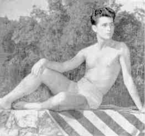
WILLIAM KAPELL sun bathes between engagements. He has July 11 date at Ravinia Park. (Album: Prokofiev's "Concerto No. 3.")