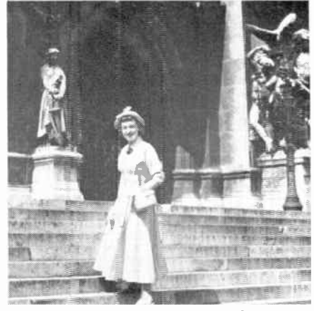
EUROPEAN FAVORITE , Risë Stevens is popular in Vienna, Paris (above), Milan, etc.