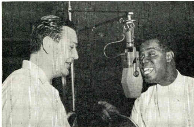
BIG TEA AND SATCHMO

Louis Armstrong and Jack Teagarden, assisted by a band of all-stars, have cut a platter together which is now in music stores throughout the country.