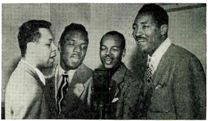
The Delta Rhythm Boys, dispensers of fine four part harmony, are flying plenty high. One reason for their great popularity is their RCA Victor records, the latest of which is My Future Just Passed and Come In Out of the Rain.